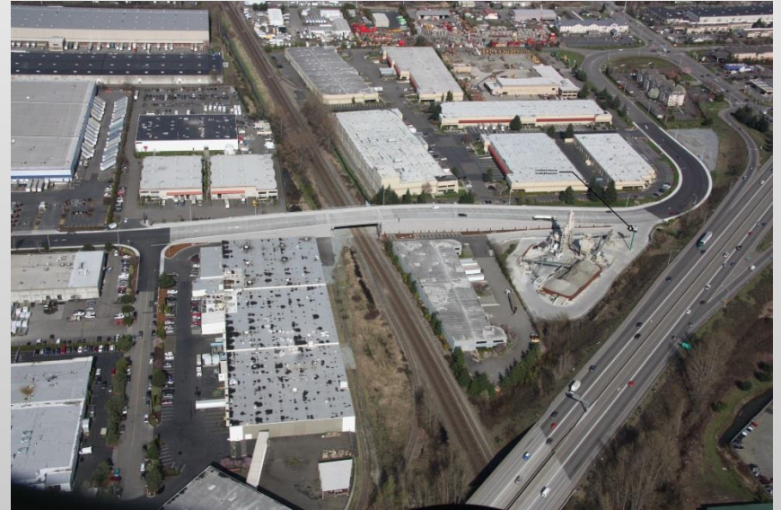
South 228 th Street BNSF Overpass