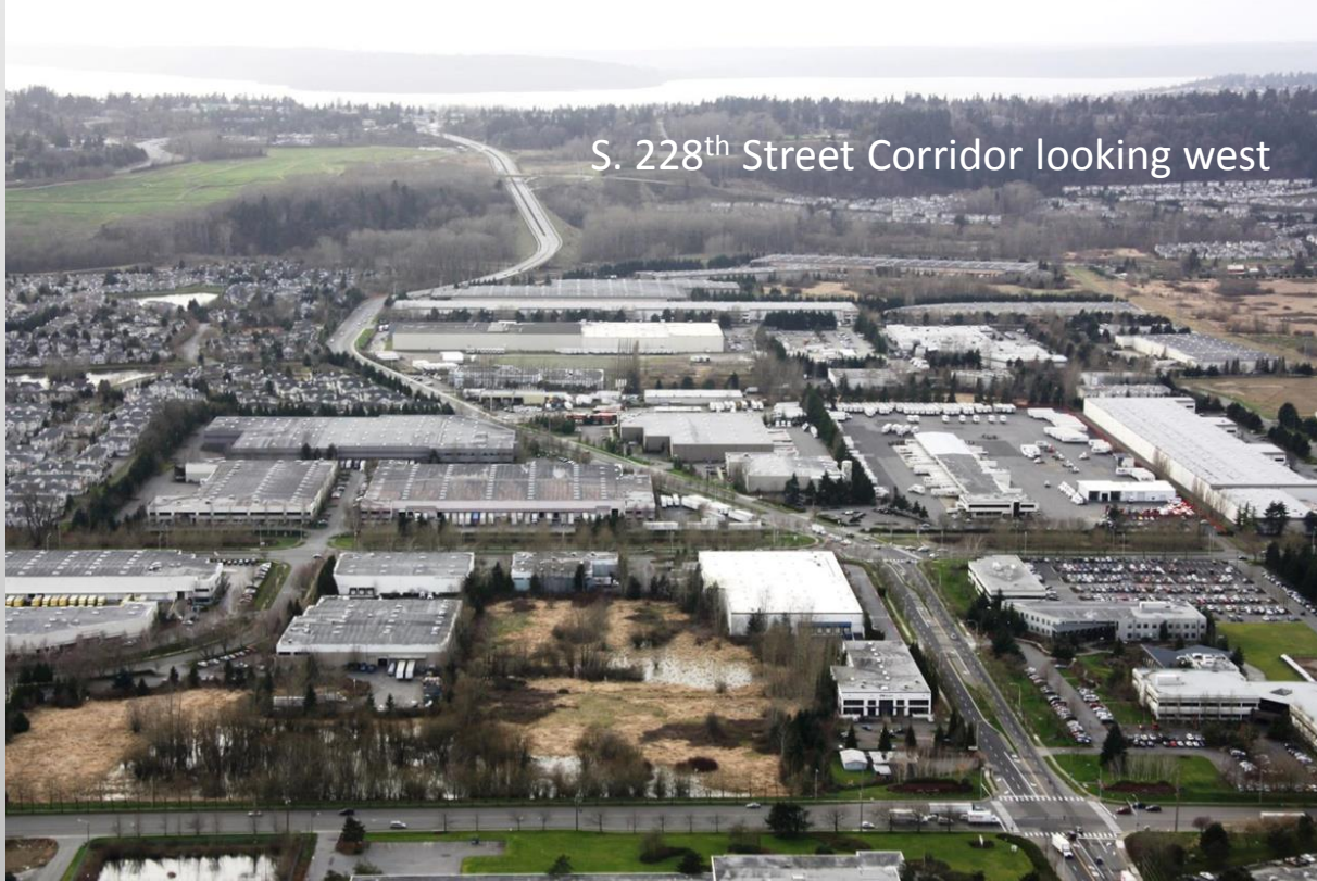
S. 228 th Street Corridor looking west